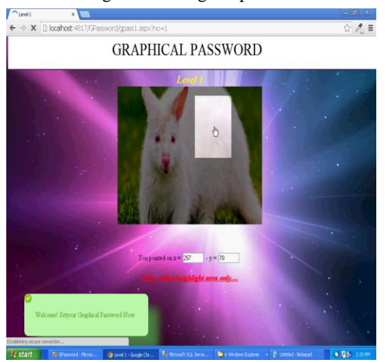
Fig 4. Selecting the pixel on image 1

Here the user will enter the email address, user name, and then selects the images for setting the password. Given below are the images for setting the password: