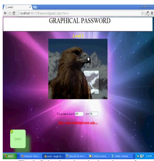
Fig 5. Selecting the pixel on image 2

the area from which the user can select the pixel for setting the password. This area is mathematically calculated and projected as the least guessable area. This highlighted area will be different for different users and images.