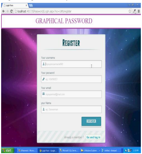
Fig 3. Registration Process

The proposed method is practically experimented to demonstrate the working model of the same. As mention in the system architecture the first step is the registration Selecting the pixel: The highlighted area on the images is process. Given below are the screen shots taken while a user is registering with the system: